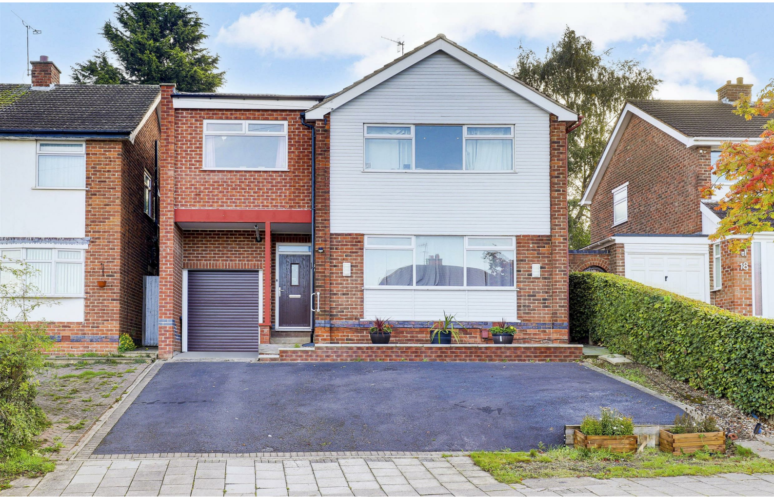
Greythorn Drive, West Bridgford, Nottinghamshire NG2 7GG